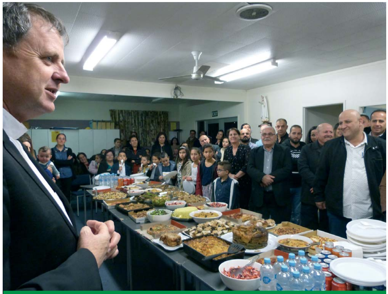
A convivial moment organized in honour of the Iraqi refugees supported by the Order of the Holy Sepulchre received by Msgr. Steve Lowe, bishop of Hamilton.

leadership of Caritas Aotearoa New Zealand, the local affiliate of Caritas Internationalis.